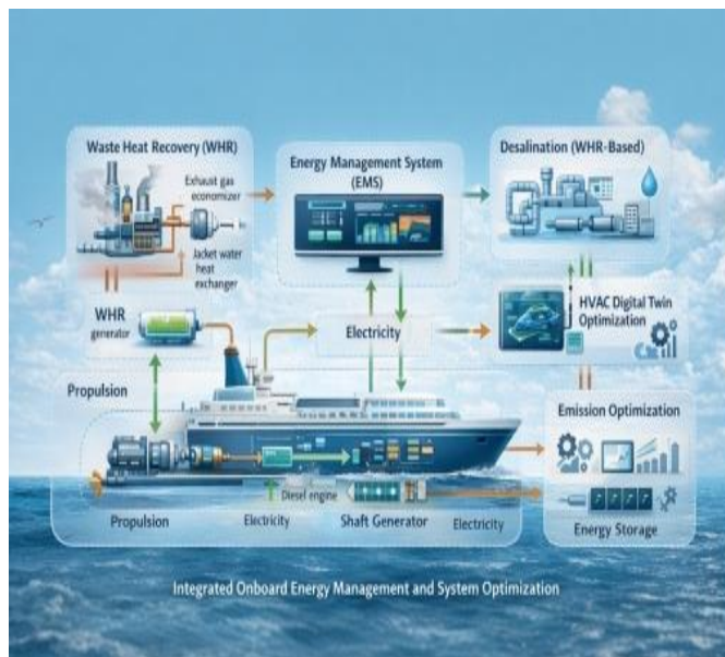
Figure 3. Integrated onboard energy management architecture for maritime energy efficiency enhancement. The schematic illustrates the integration of propulsion, waste heat recovery (WHR), WHR-based desalination, HVAC digital twin optimization, energy storage, and real-time energy management systems (EMS). Arrows represent energy and control flows coordinated to improve efficiency, reduce emissions, and enhance regulatory compliance.

Sources: Miller et al. (2024); Barone et al. (2025)