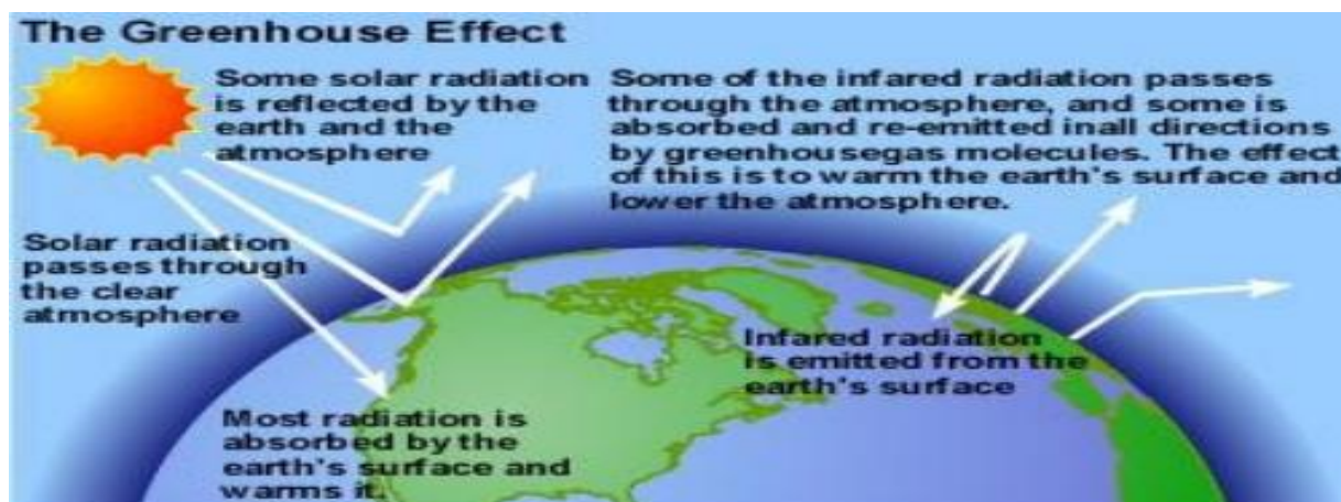
Fig. 2The Greenhouse Effect

Definition Radiation: energy that is propagated in the form of electromagnetic waves.