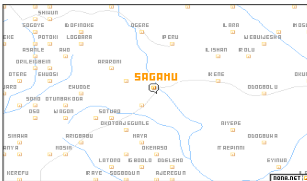
Fig. 1 Location map of the study area

According to (Ratti et al., 2001), it is a low temperature dehydration procedure that entails chilling the product, reducing pressure, and sublimating the ice. Because of the low processing temperature, the rehydrated product has outstanding quality and retains its original shape. The samples were freeze dried in the laboratory at the Department of Chemistry, Federal University Oye-Ekiti to avoid loss of volatile elements at 55°C to 0°C for 6 hours with a regular power supply and finally kept in different polyethylene bags to avoid contamination.