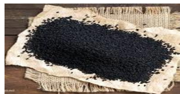
Fig 1, Nigella sativa seeds

The Nigella sativa grains (Figure 1) were prepared by drying them in the shade at room temperature (30-25 C) naturally for a week, considering the continuous stirring daily to prevent rotting.